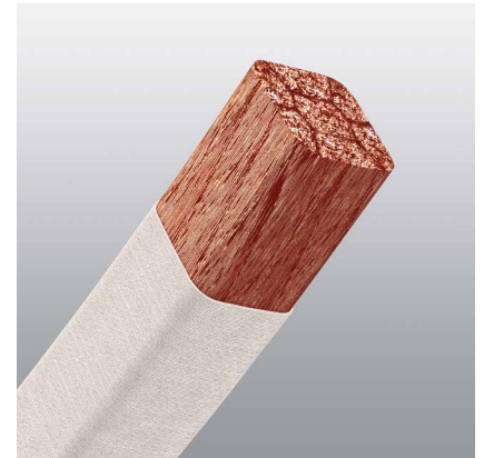
RUPALIT® Plus Profile